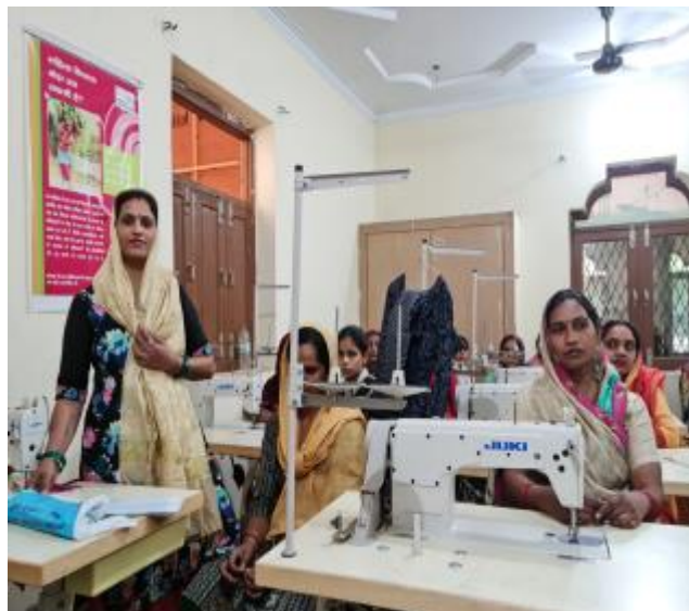
Production Activity and Training of new participants at “Nab Kaushal Vikas Kendra”.