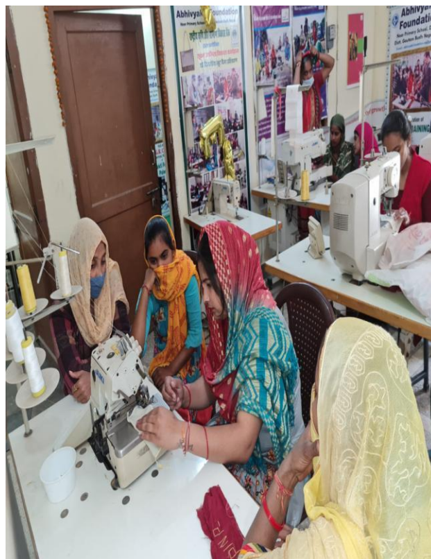
Training by ATDC supported by NBCDFC at Nab Kaushal Vikas Kendra