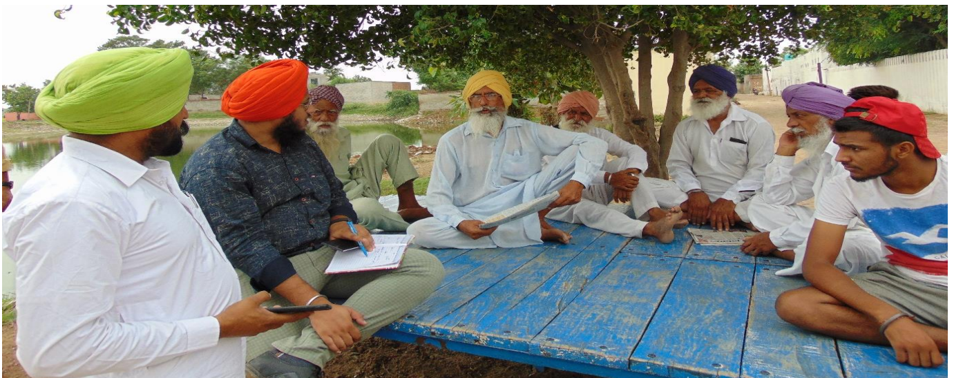
Advocacy cum Coordination meetings

As part of the project's advocacy and coordination efforts, a meeting was convened with the Sarpanch and Gram Panchayat members of Ghal Kalan, Rattian, Dhalle Ke, Khosa Pando & Khosa Randhir to make them aware of the benefits of the project. As the panchayat was defunct, permission was taken from the Block Development Officer.