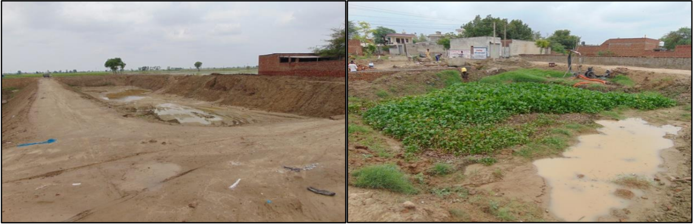
Ponds of Village Khosa Pando work started by Village Gurdwara Sahib after Water Campaign

There are different sources of water bodies present at village level. Village ponds of different size are present. In the village Khosa Pando total 02 ponds are present, and are of big size measuring about more than 1 acre. It was observed that villagers discharge domestic drain water to both the ponds. It was also observed that both the big ponds receive the domestic drain water directly to the ponds. The Gurudwara committee has taken several initiative in the present like waste water treatment through three water filtration tank. The Gurudwara committee also maintained the village drain and plantation in school and villages.