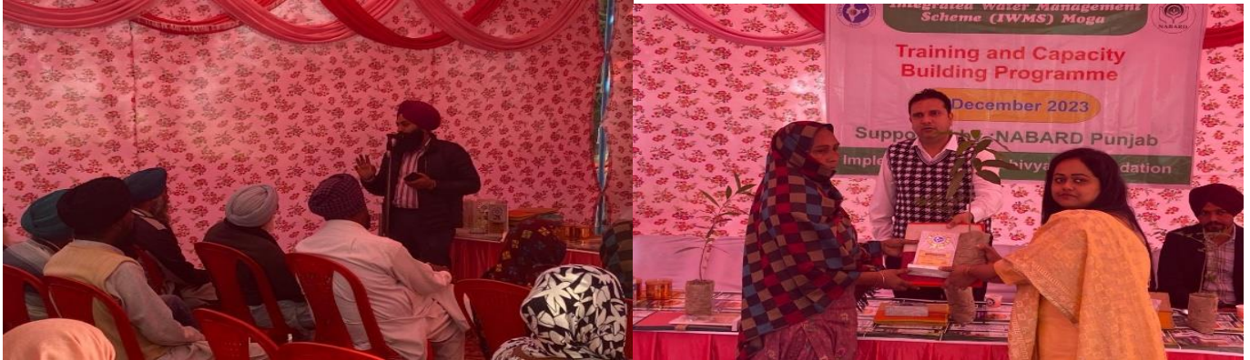
Training and Capacity Building Programme at Villages