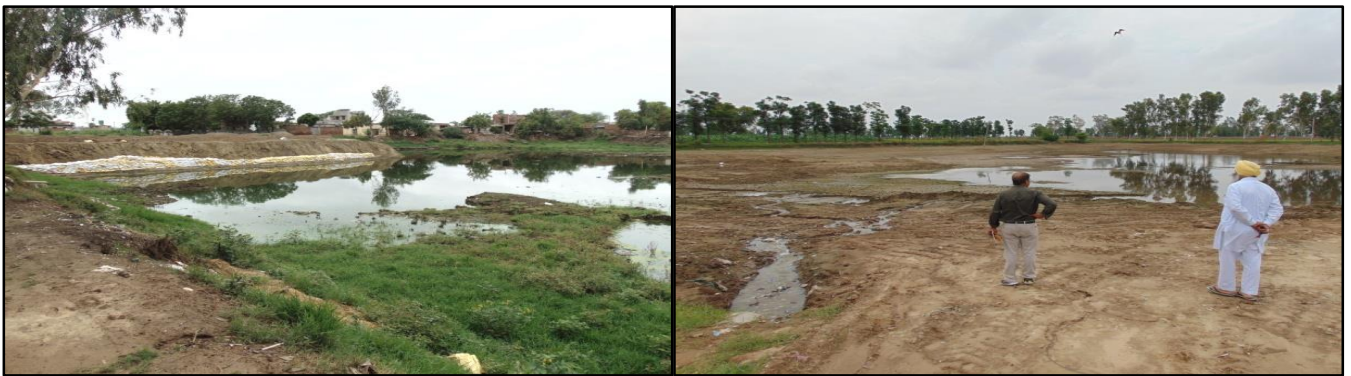
Water bodies visited with Sarpanch of the Village Gal Kalan, Moga, Punjab

There are different sources of water bodies present at village level. Village ponds of different size are present. In the village Ghal Kalan there are total 03 ponds are present, out of three 02 ponds are of big size measuring about more than 2 acre and 01 small ponds measuring about 0.5 acre. It was observed that villagers discharge domestic drain water to both the ponds. It was also observed that both the big ponds receive the domestic drain water directly to the ponds. One big pond is situated in the middle of village which gets over flooded during the rainy season and create locomotive problem for the villagers. Some people also complained that during the rainy season the over flooded water get into their houses and create problem for them. The rain water in the season stands for long and helps in creating water borne diseases. Another big pond measuring about more than 2 acre situated outside the village and remains dry except the rainy season.