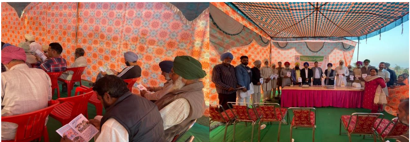
Booklet distribution during the training programme

To generate the need for maintenance of the treated wells and ponds in the villages, the Abhivyakti Foundation has already printed 200 booklets and distributed them within the village to promote awareness among the villagers about wastewater management and pond water management.