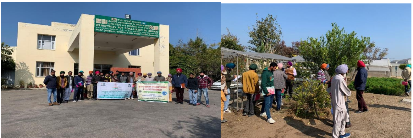
Farmers visit at Kartarpur

On 31st January 2023 Abhivyakti Foundation with the financial assistance of the National Bank for Agriculture and Rural Development (NABARD) Punjab Regional office organized a CAT visit for farmers of villages covered under the IWMS scheme Moga at the Centre for Excellence (CEV) in Kartarpur. The visit was aimed at providing farmers with an opportunity to learn about the latest practices and technologies in the field of agriculture and horticulture.